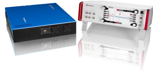
Image right: The DLC pro is a platform driving all tunable diode lasers of TOPTICA: One controller for all wavelengths.

Image left: TA-SHG pro – High-power, tunable, frequency-doubled diode laser