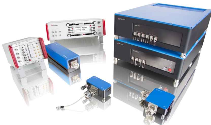
Image: TOPTICA's Difference Frequency Comb (DFC) is robust, high-end, 19"-rack integrable and can be operated remotely from a single window.

Jan Brubacher +49 89 85837-123 jan.brubacher@toptica.com