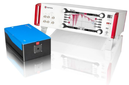
Image: The CTL is the ultimate choice when looking for a laser that is widely and continuously tunable without any mode-hops.

Our family of Continuously Tunable Lasers CTL has a new member: CTL 900 extends the wavelength range down to 880 nm (up to 1630 nm) and is ideal for resonantly exciting quantum dots.