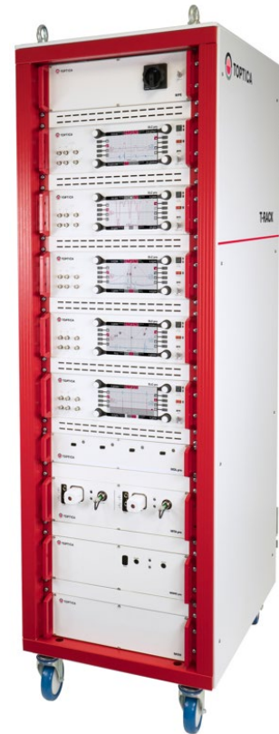
Modular and compact 19" Laser Rack Systems for Quantum Technology 2.0 Applications

Image right: TOPTICA's Laser Rack Systems are designed to support a broad range of Quantum Technology applications.