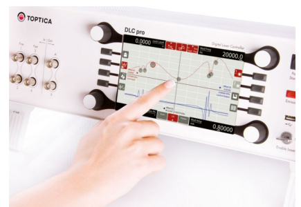
Image: DLC pro – All-digital controller for tunable diode lasers. One controller for all wavelengths. The DLC pro is a platform driving all tunable diode lasers of TOPTICA.

The DLC pro platform driving all tunable diode lasers of TOPTICA offers two new features: the MOTOR pro option for motorized wavelength selection and the AutoPID wizard for frequency locking with automatically optimized PID parameters.