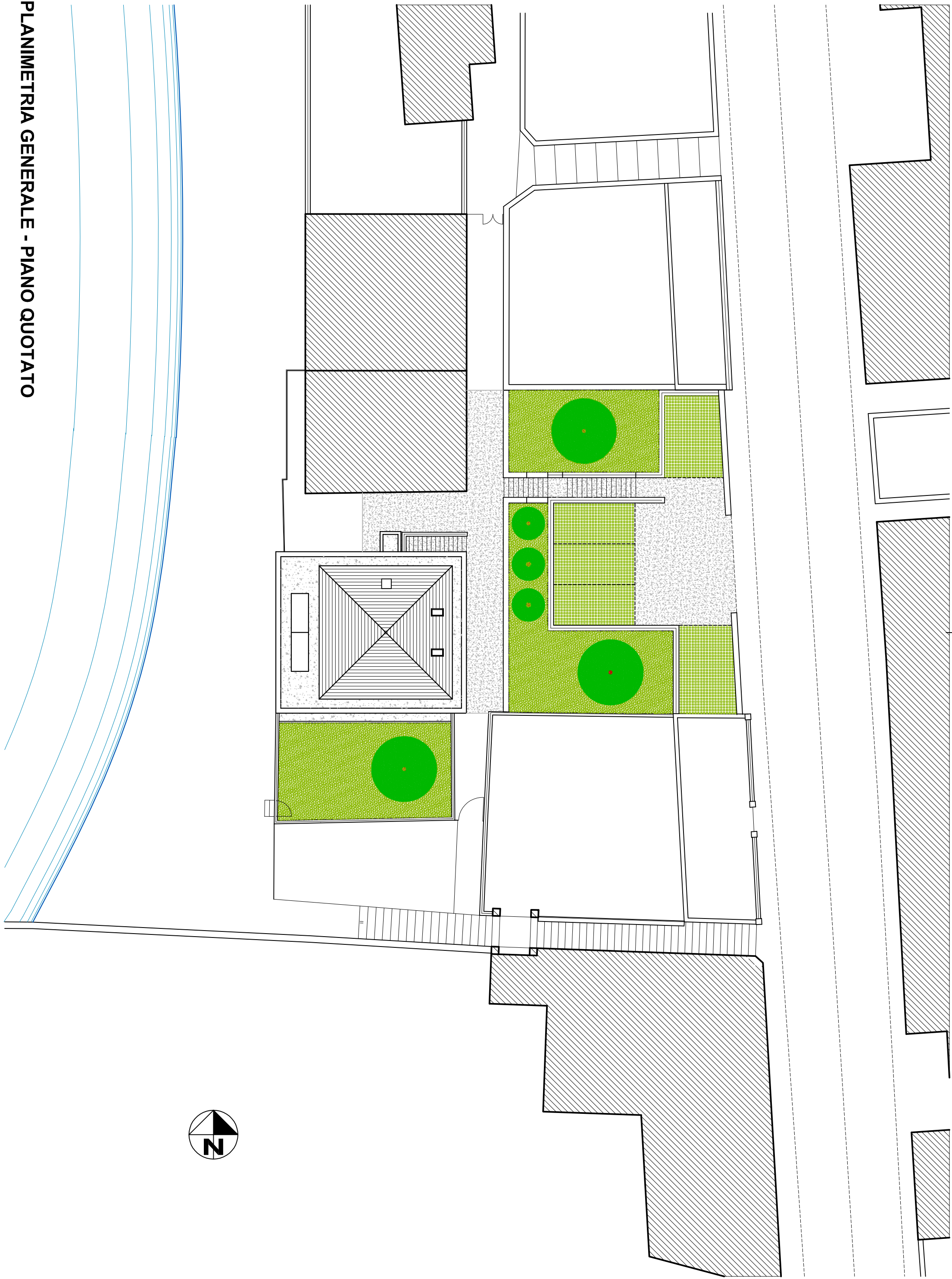
PLANIMETRIA GENERALE - PIANO QUOTATO