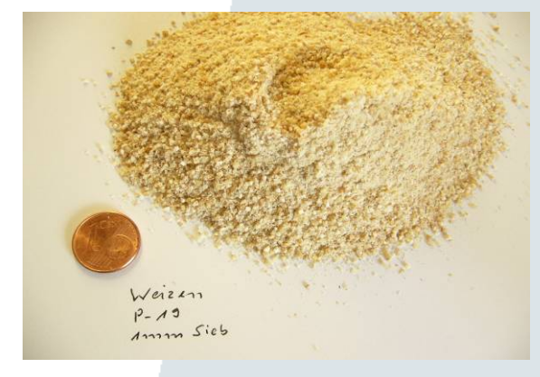
A convincing result: comminution of wheat down to 1 mm with the Cutting Mill PULVERISETTE 19

For the preparation of smaller sample amounts (< 100ml) of these materials, the Variable Speed Rotor Mill PULVERISETTE 14 is also very suitable.