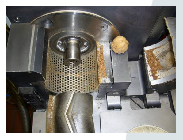
A glance into the mill after grinding

The standard funnel for long and bulk material was chosen carefully. For one, this funnel is easy to clean, for the other, the mill should have the opportunity by adding the nuts slowly, to comminute the material and release it from the grinding chamber. Otherwise, if there is too much material in the grinding chamber, the possibility that the material is warmed and more oil separates, increases. A 4mm sieve cassette was used. In less than two minutes all nuts were processed. For a sample of 10 kg, 15 to 20 minutes have to be assumed. Also a communition of small quantities with a 2 mm sieve cassette is possible.