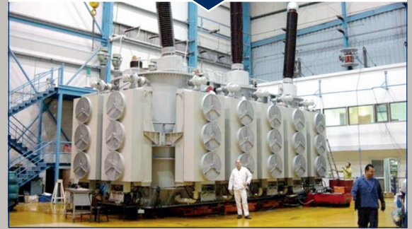
500 MVA, 420 kV Transformer