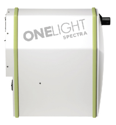
Profile view of the OneLight Spectra Spectrally Programmable Light Engine (SPLE).

Visit us in Hall B1, Booth 421 and see our product range from Laser and optronic components and systems to Systems for Laser Micromachining, Solutions for Laser Protection, Optics & Optomechanics, Optical Instrumentation, Image Processing and Infrared Technology.