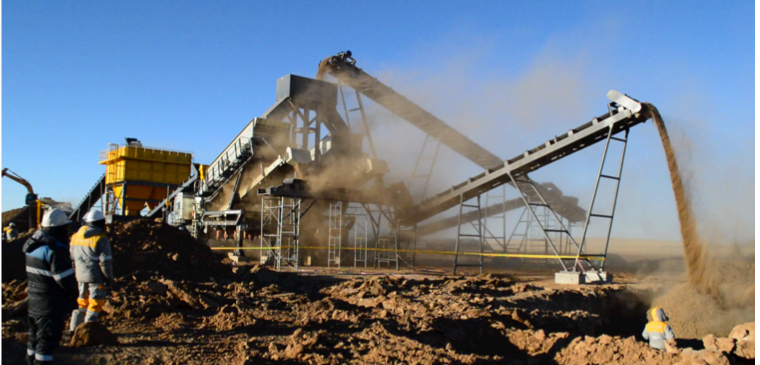
Crusher & Conveyor