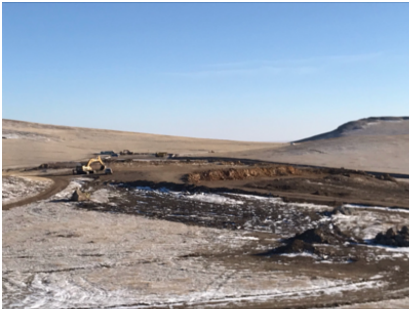
Open cut operating on the ATO1 Deposit