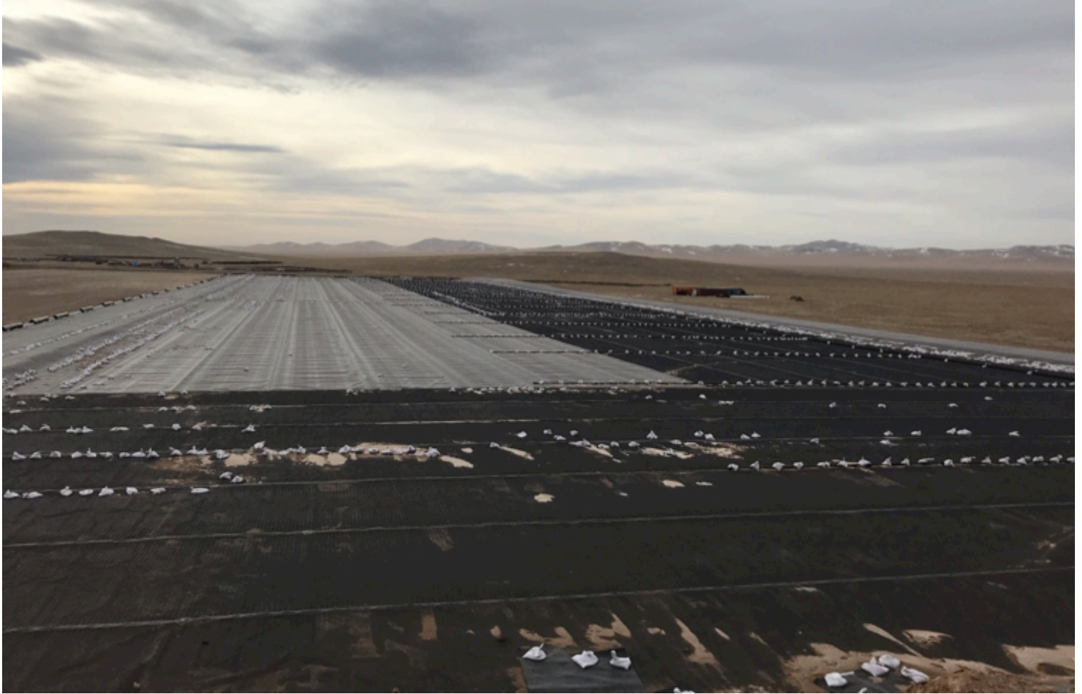
Cell 1 Complete