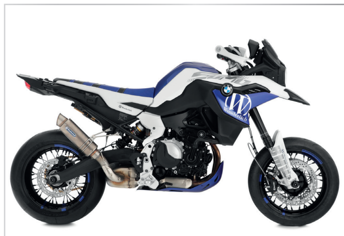
Wunderlich F 850 »SuMo« SuperMoto