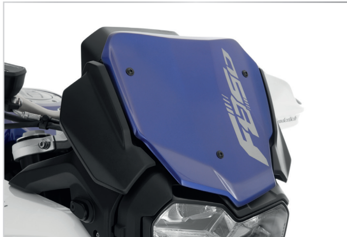
The Wunderlich »FLOWJET« has already inspired countless boxer GS drivers and has now been newly developed for the SuMo