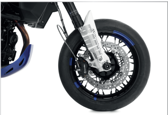
Integrated Wunderlich design right down to the rims