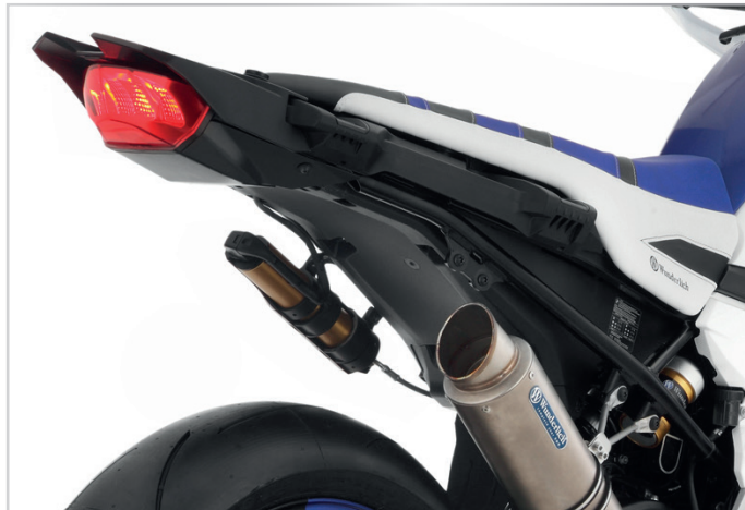
Wunderlich F 850 »SuMo« SuperMoto