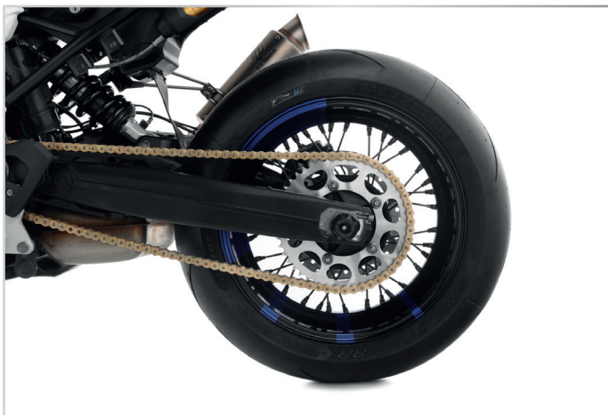
The big rear sprocket for spontaneous start