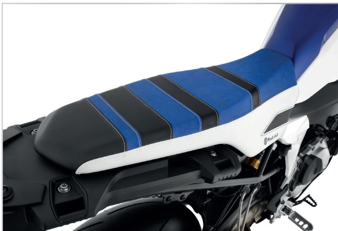
The taller, yet narrower bench for the perfect SuperMoto feeling.