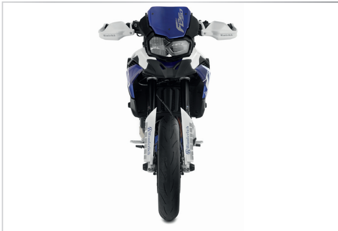
The SuMo also captivates in the front view by their striking appearance