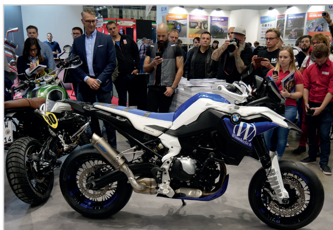
Revealed: Wunderlich F 850 »SuMo« SuperMoto