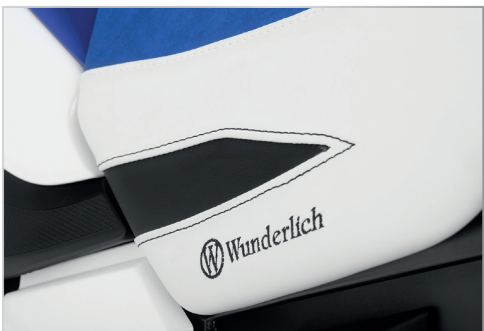
The lines of the seat were perfectly matched to the design of the BMW F 850 GS.