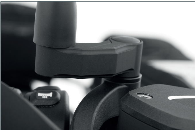
Wunderlich mirror extension (Item-No.: 26100-002)