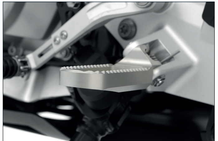
Wunderlich Lower footrests ERGO-Comfort (Item-No.: 25910-201)