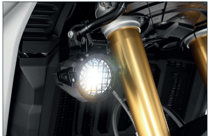
Wunderlich Auxiliary light protection (Item-No.: 42839-302)