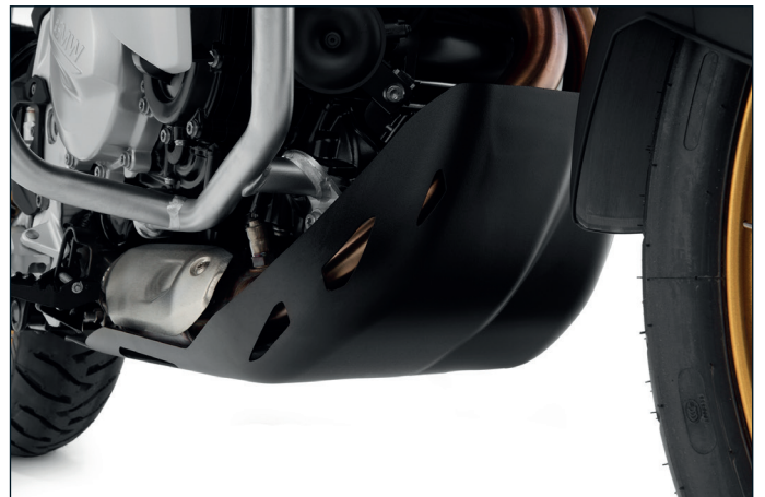
Wunderlich engine protection »EXTREME+« (Item-No.: 26840-30x)