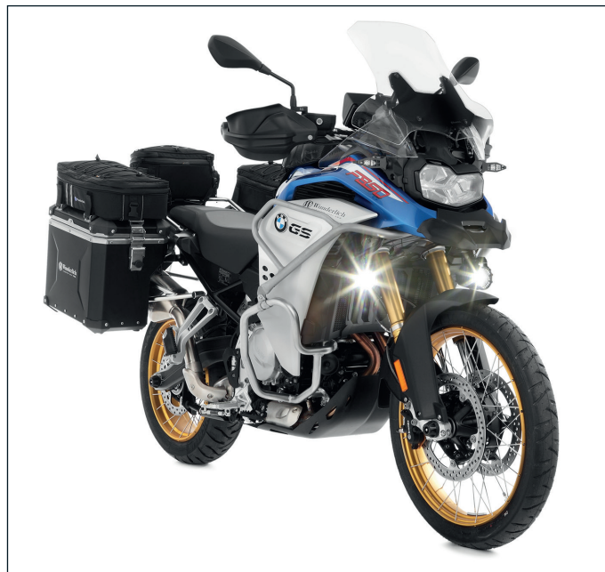
BMW F 850 GS Adventure with Wunderlich equipment