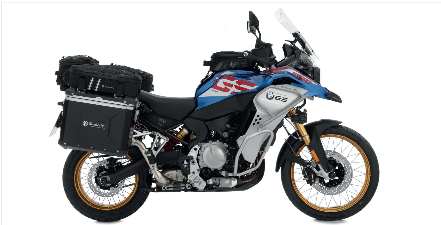
BMW F 850 GS Adventure with Wunderlich equipment