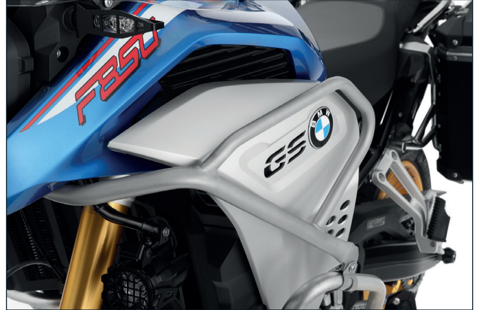
Wunderlich Tank protection bar »ADVENTURE« (Item-No.: 41580-400)