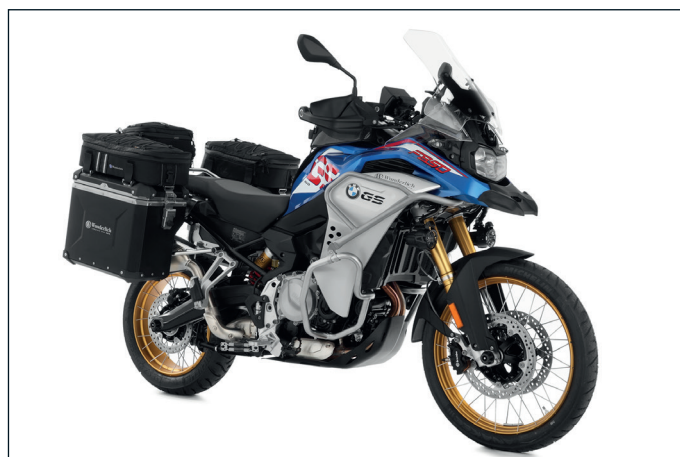
BMW F 850 GS Adventure with Wunderlich equipment