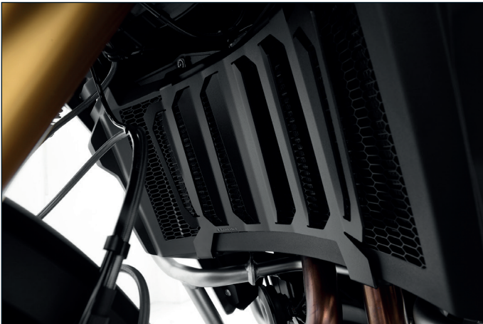
Wunderlich Water cooler protection »EXTREME« (Item-No.: 25854-002)