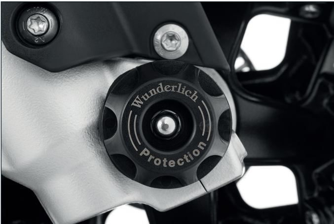
Wunderlich Axle crash pads »DOUBLESHOCK« (Item-No.: 42156-102)