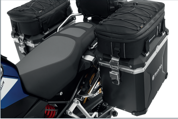
Wunderlich Luggage System »EXTREME« (without Pannier bag) (Item-No.: 30167-30x)