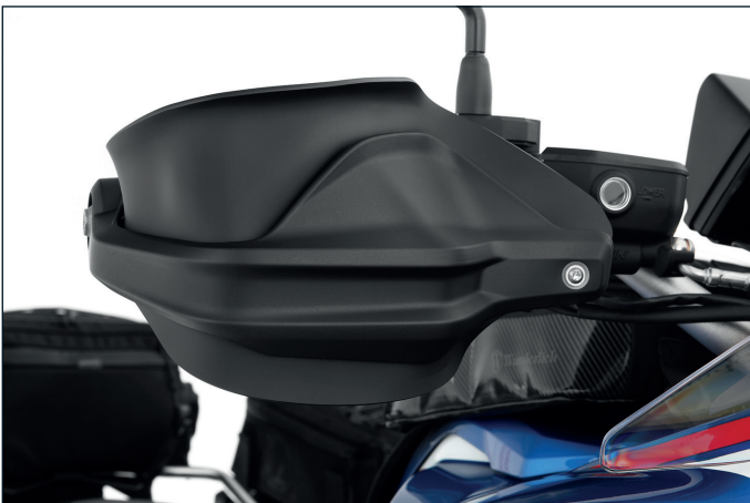
Wunderlich Hand guard extension »ERGO« (Item-No.: 44940-002)