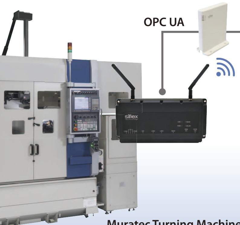
Muratec Turning Machines MW120EX & MD120II

FANUC Robodrill, etc. (Hall 9, Stand A50) and other machine tools controlled by FANUC CNC