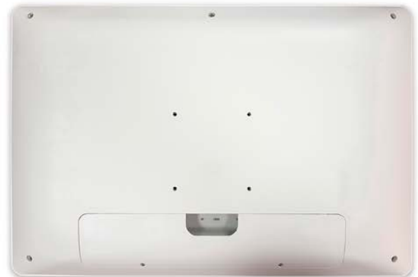
Rear view with cable cover and VESA mounting holes