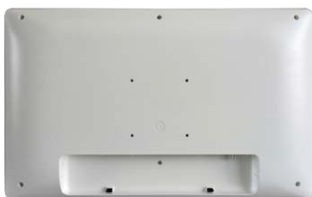
Rear view – cable cover removed