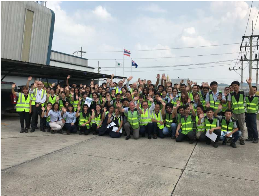
The approximately 70 employees of MHG Thailand will be taken over and are looking forward to the future at Huf Thailand.