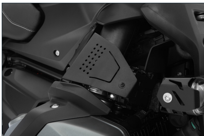
Effectively protects the components of the injection system against any mechanical stress (Item-No.: 42940-602)