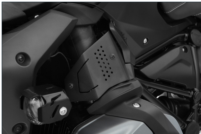
Wunderlich fuel injection system cover - left - on the BMW R 1250 R, black (Item-No.: 42940-612)