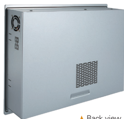
▲ Back view