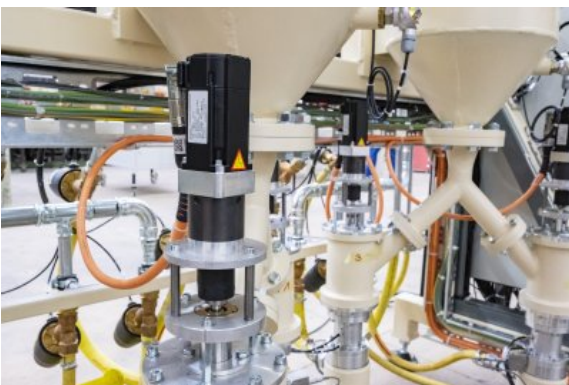
Picture 4 – AKM servomotors by KOLLMORGEN with single cable connection technology in the Roxor shot-peening system.