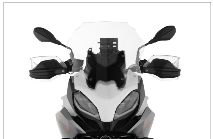
Optimally relieves wind pressure for head, upper body and shoulders and noticeably reduces turbulences