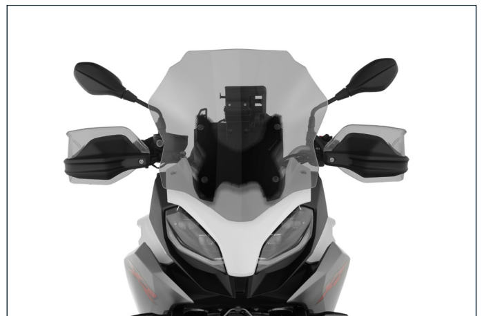
... and smoked grey for the BMW F 900 XR (Item-no.: 30742-006)