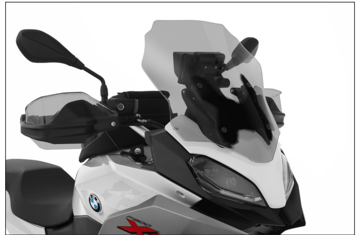
Relaxed driving: Effective wind and weather protection with distinctive, ergonomic long-distance comfort

Wunderlich offers its proven »MARATHON« windshield, always designed specifically for each model, for almost all current and many older BMW model series.