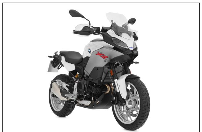
Wunderlich BMW F 900 XR with the »MARATHON« windshield in transparent