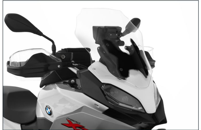
Wunderlich's »MARATHON« windshield is available in transparent (Item-no.: 30742-005) ...