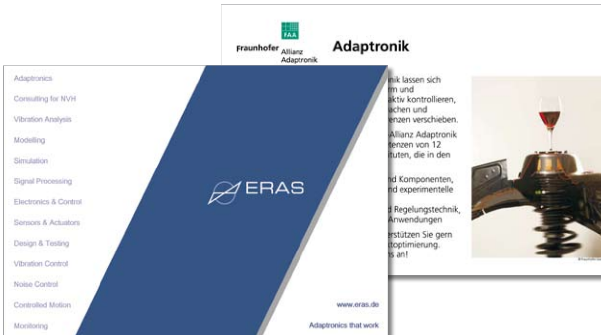
1/1 page (DIN A5, Landscape format)