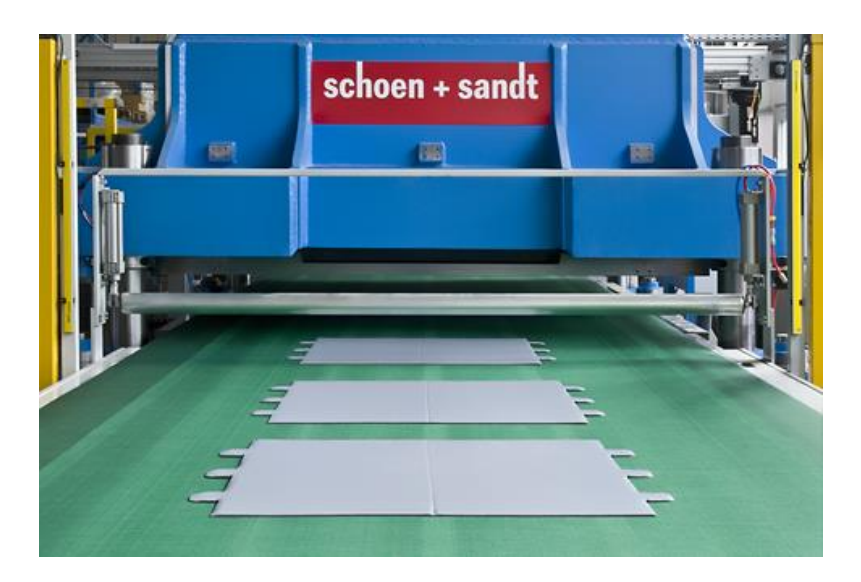
high-performance coil-punching machine by montara Verpacken mit System GmbH