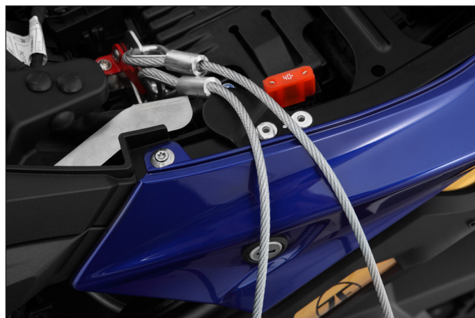
Keeps thieves at bay: 5 mm thick wire rope secures the helmet against theft