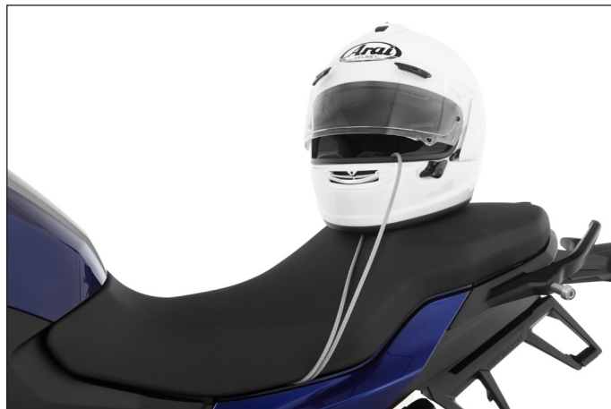
Helmet anti-theft system »HELM-LOCK« - now also available for the BMW F 900 R and XR (Item-no.: 44320-800)

44320-800 - Wunderlich helmet anti-theft system »HELM-LOCK« (68,14 €*)