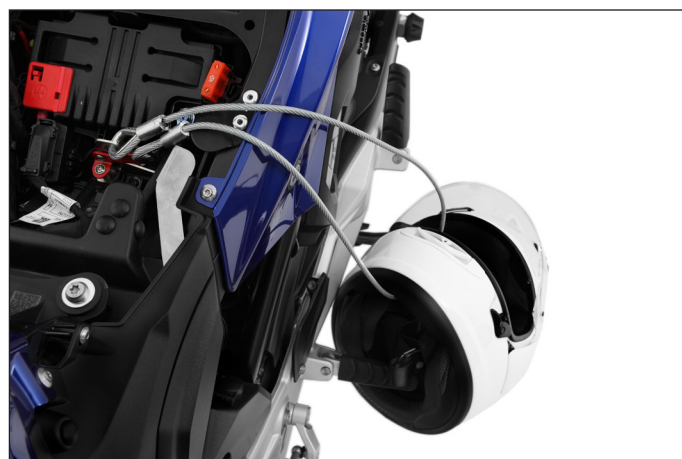
The length of the safety rope is dimensioned so that up to two helmets can be secured