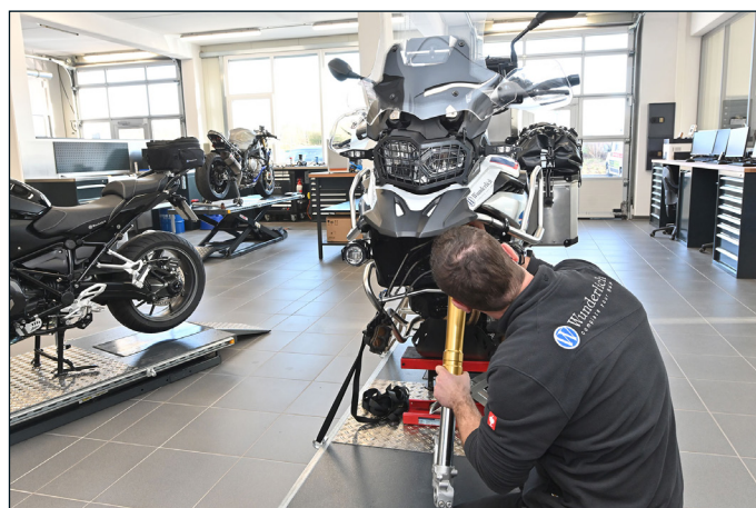
At the Wunderlich Suspension Centre ...