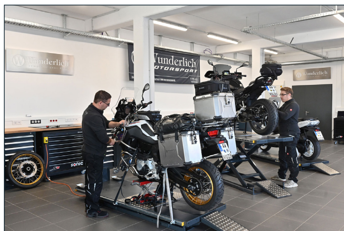
... it's all about the suspension.