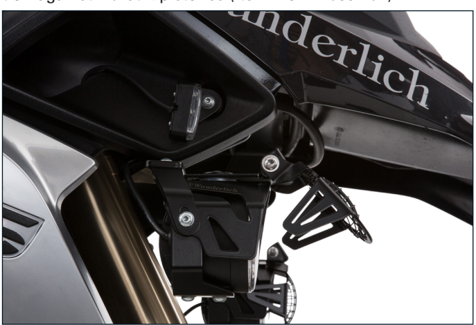
The headlight and grille are easy to clean thanks to a practical folding function