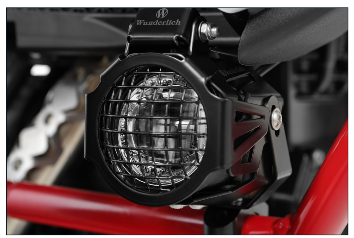
Wunderlich »ATON« LED auxiliary headlight - ...