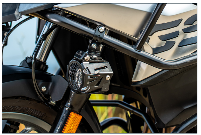
The lamp protection grills consists of a robust, black coated metal structure