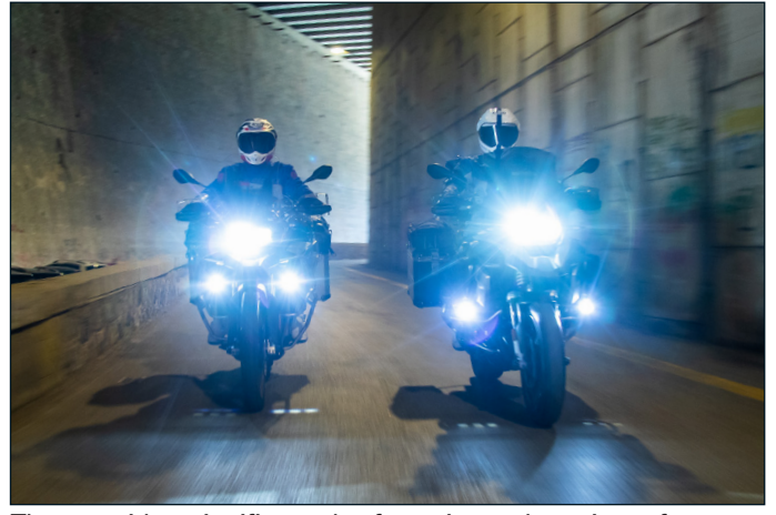
They provide a significant plus for active and passive safety thanks to the visibly balanced enlargement of the front silhouette and appearance of the motorcycle