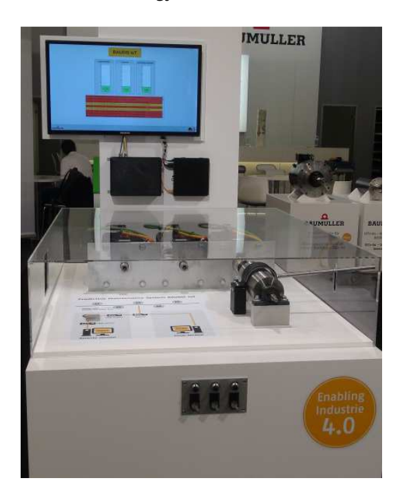
Fig. 2: BAUDIS IoT offers an intelligent networking of machines and systems via the Internet, analyzes data and if needed generates a recommendation for action