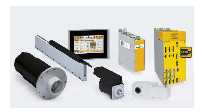
Fig. 4: From a drive with an aseptic surface for transport tasks in the food sector to compact local drive technology for minimum wiring effort. Baumüller will present many industry-specific solutions for food and packaging at Interpack