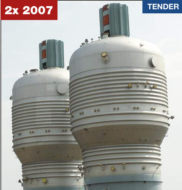
oxidative esterification reactors Kobelco JCWSA-100163 - cap. 218.460 l

BRAND NEW & NEVER INSTALLED Columns, Heat Exchangers, Reactors & Tanks (all OEM Documentation Available)