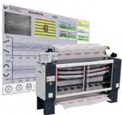
Fig. 4: Orthopac RVMC with Software

"The scanning system detects and analyses the regular basic structure of the weft threads, courses or rows of tufting. It automatically adapts the control system to a wide variety of textiles, even with the most complicated fabric structures", explains Mahlo's Sales Director Thomas Höpfl.