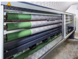
Fig. 3: Straightening with the Mahlo Orthopac RVMC

Along the entire production process knitted as well as woven fabrics are permanently subject to distortion, tension and elongation, which need to be controlled and corrected. Therefore Esquel has invested in several fully-equipped Orthopac RVMC-15 automatic weft-straighteners from Mahlo.