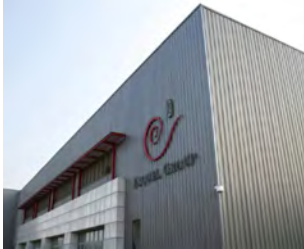
Fig. 1: Esquel Facility

Esquel Group and German Mahlo GmbH collaborate for quality, efficiency and sustainability in production