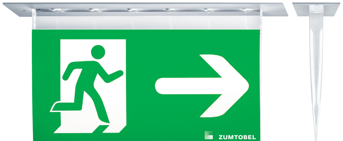
B4 | The COMSIGN II LED escape sign luminaire designed by Matteo Thun boasts an extra-long service life and low energy consumption.