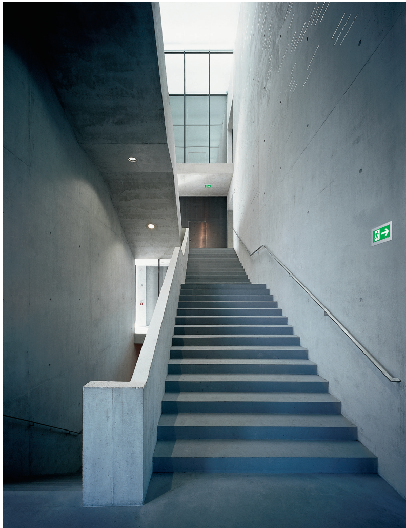
B3 | High-quality aluminium enhances the look and prolongs the service life of the ARTSIGN escape sign luminaire.