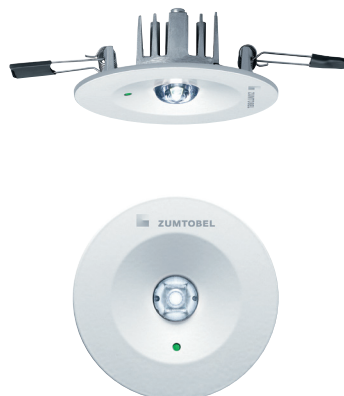
B5 | To prevent panic in an emergency, RESCLITE antipanic uniformly illuminates very large areas.

for escape route or anti-panic lighting. Within the escape sign luminaire portfolio you can choose between nine different product ranges: from small and delicate luminaires to extremely large ones for airports or extra-large halls with recognition ranges of up to 90 metres. All luminaires are characterised by minimum energy consumption, both in normal operation and during emergency operation. Moreover, we also supply luminaires for harsh environmental conditions. All luminaire ranges and design versions are available for all types of supply: for individual battery, group battery or central battery systems. In other words: we cover pretty much any conceivable application area of emergency lighting in conformity with relevant standards.