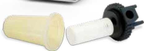
Functional filter prototype printed in clear, white and black rigid plastics