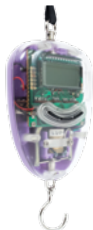
Print transparent, functional components and housings to see internal workings as assembled

Your products are made of multiple materials—and now your prototypes and concept models can be printed in multiple materials, giving your 3D prints more realistic mechanical properties and differentiated colors.