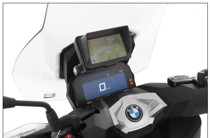
Wunderlich GPS base holder for the BMW Scooter C 400 GT and C 400 X (Item-no.: 21095-002 and 21095-202)