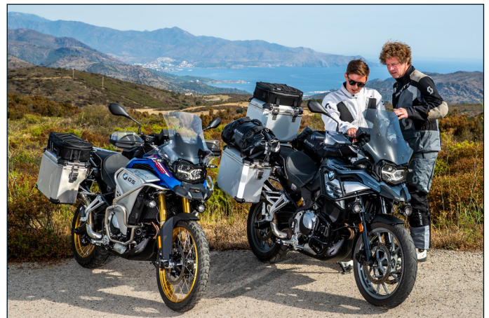
Wunderlich equipped BMW F 750 GS and F 850 GS Adventure