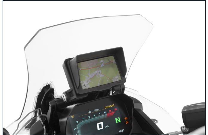
Wunderlich base holder for the BMW F 750 and F 850 GS (Item-no.: 21174-002)