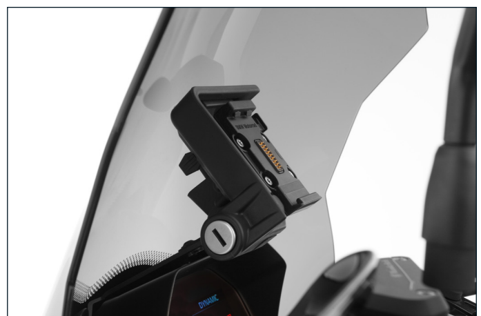
Wunderlich's GPS base holder is made of stainless steel and powder-coated in black