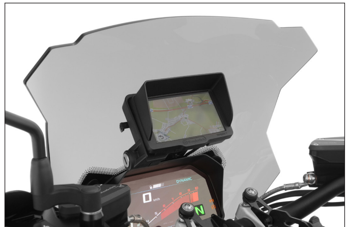
Visibility and operator ergonomically optimal in the natural direction of view, here on an R 1250 R (Item-no.: 21096-002)