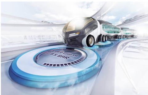
Image Nr. 35-03 TB_Roto-L_LKW.jpg. Trelleborg sees particular benefits on long-based and multi-trailer trucks where tire pressures could be optimized to road and load conditions.