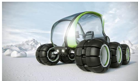
Image Nr. 35-04 TB_Roto-L_Schlepper.jpg. This would improve traction and safety, and potentially result in considerable fuel savings for transport companies.