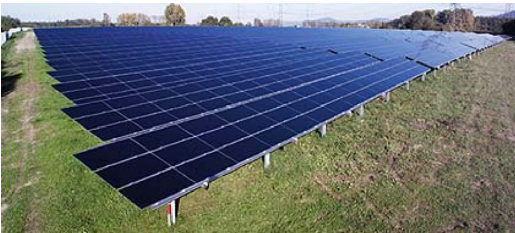
Large scale plant wired with photovoltaic array harnesses from Lumberg

Lumberg Connect GmbH Im Gewerbepark 2 58579 Schalksmühle Tel. +49 (0) 23 55 / 83-01 Fax +49 (0) 23 55 / 83-130 info@lumberg.de www.lumberg.com