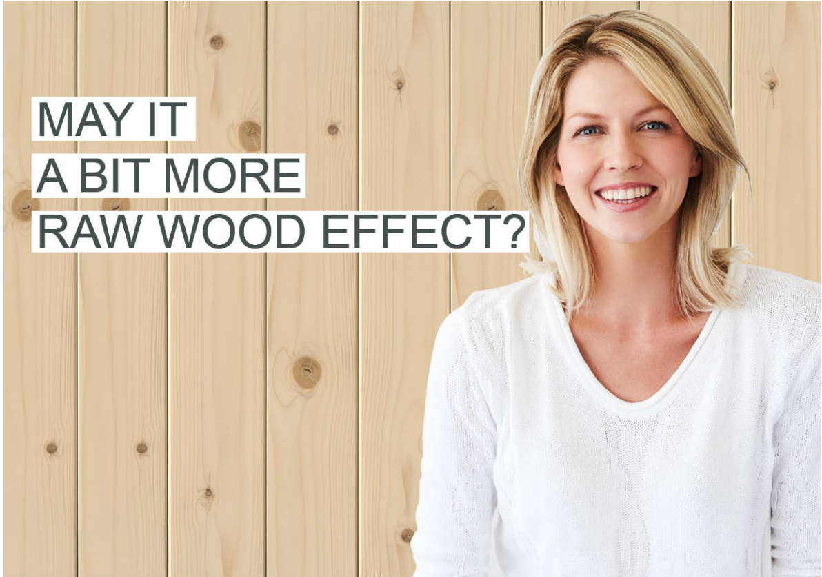
Title: May it a bit more raw wood effect?