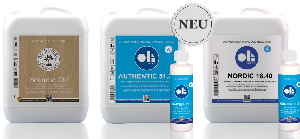
Title: Whether furniture, stairs or parquet – for every application there is an ultra-matt oil or varnish which does not accentuate the colour of the wood.