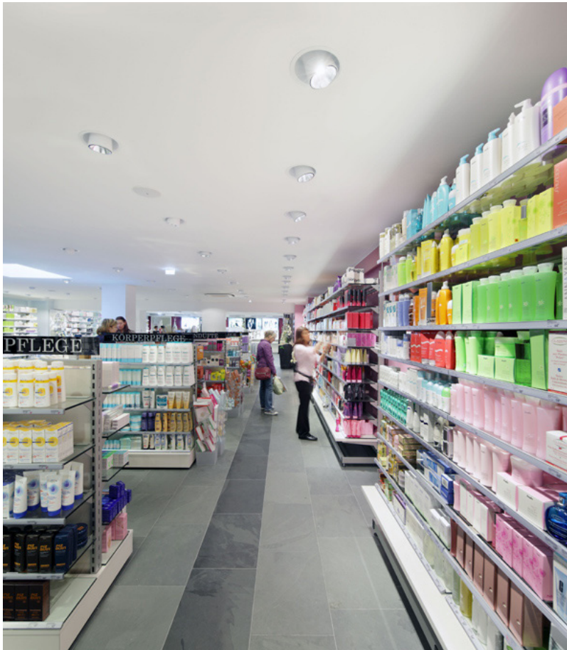
B2a + B2b | At its stand, Zumtobel re-enacts real situations of lighting solutions for all retail areas – from boutiques to supermarkets.