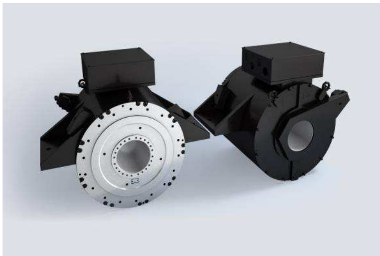
Fig. 3: Baumüller features its high-torque motors DST2 specifically with wing mounts that make it much easier to integrate them into the ship design. The high-torque motors are certified by Lloyd's Register and meet the specific requirements for shipping