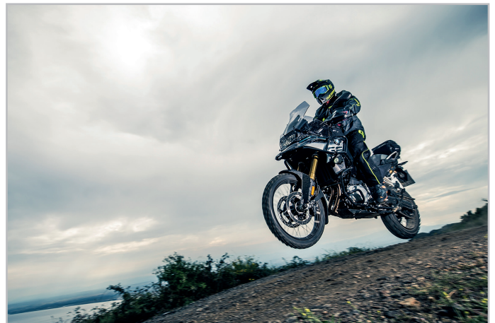
Maximum driving pleasure with the BMW F 750 GS (left) and with the BMW F 850 GS (right) in the offroad tracks ...