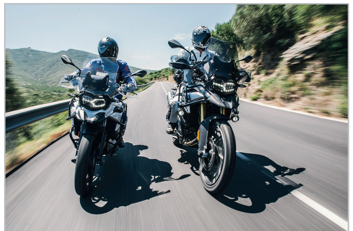
... and onroad, the »CLEVER LEVER« not only allows a smooth-shifting through the roller-mounted tip, but also reduces the friction between boots and gearshift lever to a minimum.