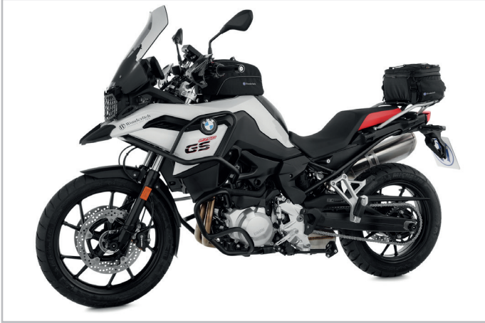
Fits perfect to the BMW F 750 GS ...