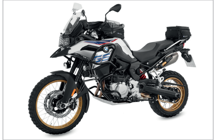
... also to the BMW F 850 GS