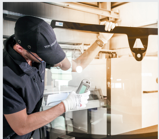
Infrared reflex coatings (IRR) on wind shields

The proven technologies and systems for large-area glass coating, a field in which VON ARDENNE has been a leading provider for more than 15 years, also offer certain crucial benefits for applications in automotive glass coating. High-performance coatings help reduce energy consumption and increase comfort and safety for drivers and passengers. For instance, infrared reflex (IRR) coatings on windshields and glass roofs prevent the interior from heating up too much, which reduces the need for air conditioning. This results in lower consumption and emission for vehicles with combustion engines or an increased range for electric vehicles . Beyond that, low-emissivity (Low-E) and anti-reflection (AR) coatings help increase the comfort in vehicles.