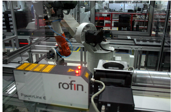
Figure 6: Marking of automobile components

The Automotive division is now the highest revenue-generating division of the company with about 60%. Here, Cherry has systematically developed into one of the leading Tier 2 suppliers for complex modules for switching and controlling. The product range extends from locking systems, switches, and controls for the inside of vehicles, shift gates, immobilizers, and brake assistants to electrical ignition locks or components for adaptive chassis.