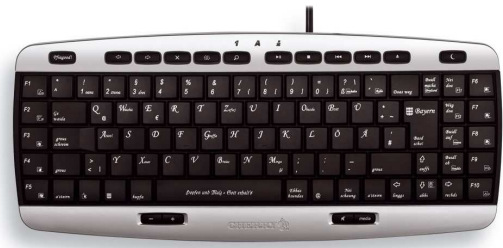
Figure 4: Extremely flexible lasers mark in both Bavarian and Frankish layouts

When Cherry's technicians returned to Auerbach, they had the concept for a new marking procedure in the bag. The prototype that arrived a while later from Bergkirchen fulfilled all expectations. Cherry optimized the composition of the plastics used for the best possible marking results, thus ultimately becoming one of the first suppliers worldwide able to offer the new, flexible, high-quality marking method for keyboards. As a result, laser marking was established as the standard method.