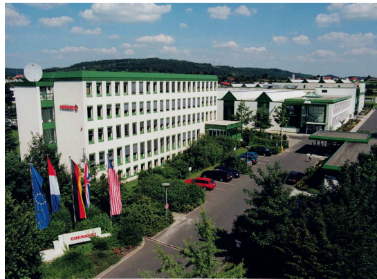
Figure 1: Cherry's headquarters in Auerbach

Bayerischer Qualitätspreis 2008 (Bavarian Quality Award), Automotive Lean Production Award 2006, Best European Factory 2005 - these are just some of the well-respected industry awards recently presented to the company in Auerbach in the Upper Palatinate. The small town between Nuremberg and Bayreuth at the edge of the "Frankish Switzerland" area in the German state of Bavaria houses the headquarters of the company, which has been successful on the world market for the last four decades. At Cherry, the largest employer in this region, which is generally considered to be structurally weak, about 1,400 employees develop and produce microswitches, keyboards, components for the automobile industry, and controls for household appliances. At the subsidiary in Wolfsbach near Bayreuth, which won an award in 2008, and a factory near Klasterec in the Czech Republic, the manufacturer also has 700 additional employees.