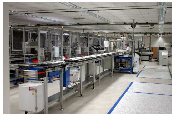
Figure 2: Manufacturing line for keyboards

The fact that the company founded in this region for the production of microswitches by American Walter Cherry in 1964 has been so successful over the decades particularly lies in the constant readiness to be innovative. This has been demonstrated most impressively in the development of new manufacturing methods, for example, in the early use of laser technology.