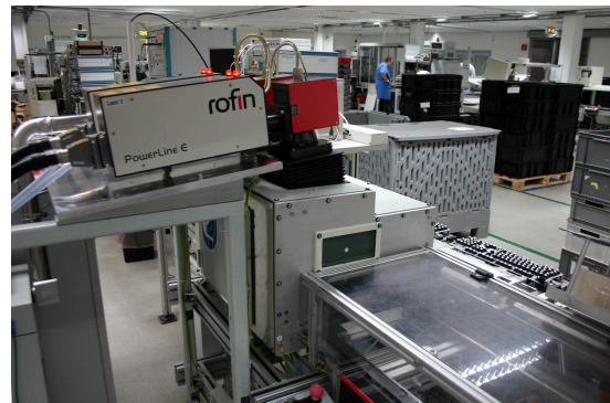
Figure 5: Marking of dark keyboards with end-pumped lasers

About 20 Rofin-Sinar second-generation diode-pumped lasers are currently in use in Auerbach: diode end-pumped beam sources. These lasers also permit marking of black keyboards using a bright color handling. Heinz Freiberger, Head of Keyboards, emphasizes there are almost no downtimes. The lasers run reliably and malfunction-free around the clock.