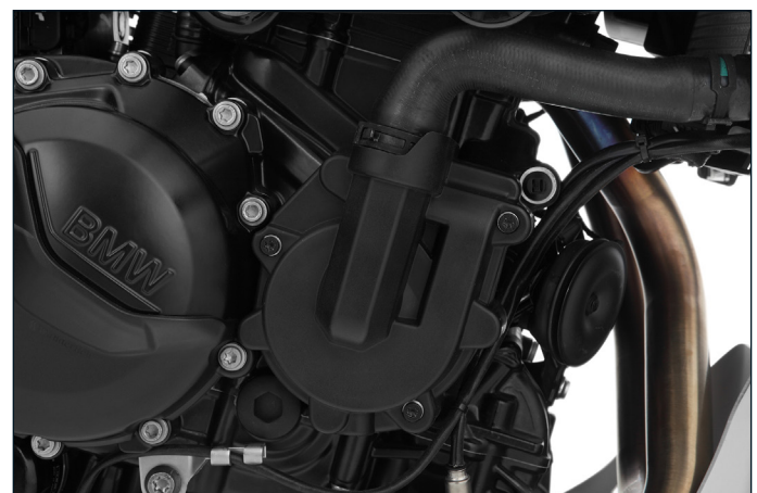
The discreet design of the water pump protective cover picks up the shape of the water pump housing