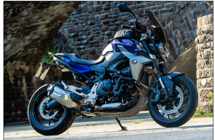
BMW F 900 R equipped with the latest components from Wunderlich

40470-202 - Wunderlich protection cover set for clutch alternator and water pump