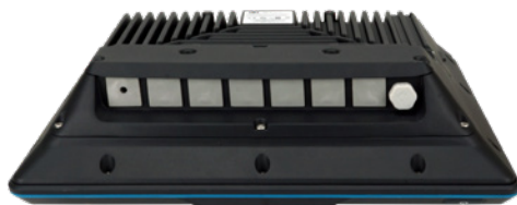
Standard IO cover