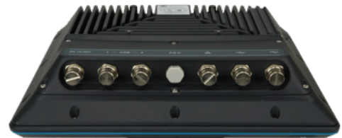
M12 IO cover