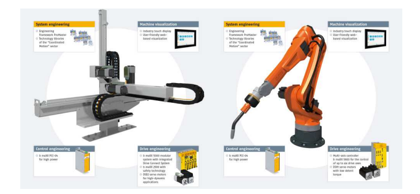
Fig. 2: Two networked material handling and robot systems at the trade fair stand will show how production is optimized through networking. The palletizing process of the 3-axle material handling system and the welding of the robot occurs in one process. The communication occurs via a Euromap interface, which is standardized in the plastics industry. Both systems are complete solutions from Baumüller, from the control software to the drive