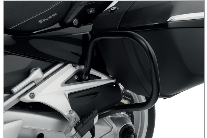
Of course, the Wunderlich Case Protection Bar should not be missing at a RT!