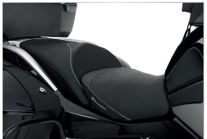
The Wunderlich seat »ERGO-KOMFORT« offers maximum comfort

THE NO. 1 WORLDWIDE FOR HIGH QUALITY BMW MOTORCYCLE ACCESSORIES.