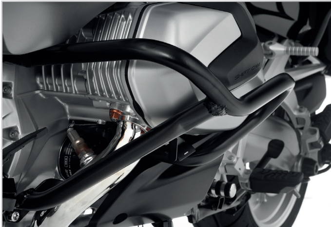
Protects the ShiftCam cylinder head particularly effectively: Wunderlich engine guard