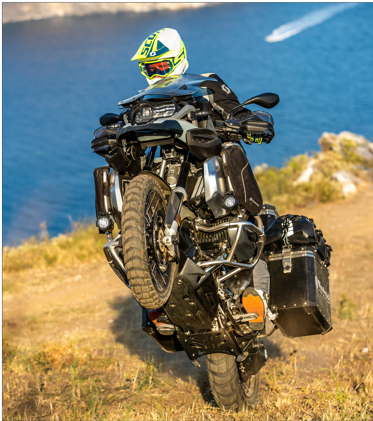
Available for more GS models | Here: Wunderlich engine protection and centre stand protection plate on the BMW R 1250 GS