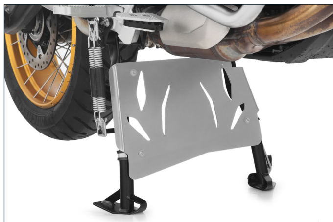
Wunderlich centre stand protection plate on the BMW F 850 GS and Adventure, silver ... (Item-No.: 25852-001)