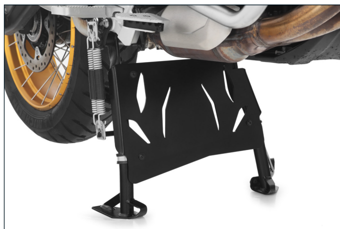
... and black anodised (Item-No.: 25852-002)