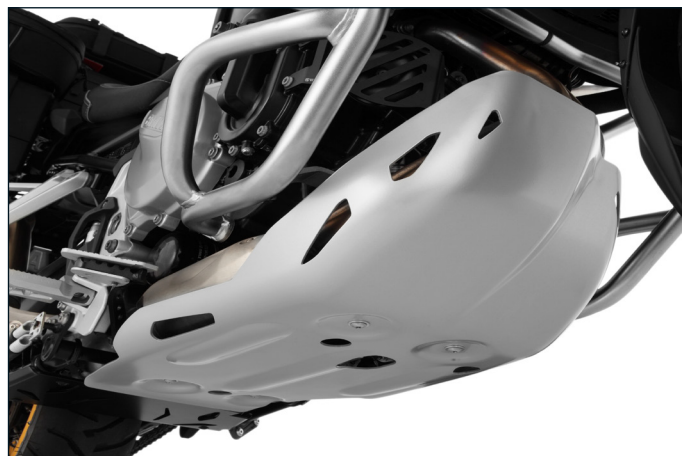
Wunderlich »EXTREME« engine protection on the BMW F 850 GS and Adventure, silver ... (Item-No.: 26840-301)

The centre stand protection plate provides reliable protection for the centre stand, the exhaust outlet and the swing arm mounting. In combination with the matching »EXTREME« engine protection, all technical components between the front and rear wheels are reliably protected against mechanical loads such as bottoming out or stone chips. Furthermore, should it bottom out, the bike can glide along the ground on a fully protected undercarriage until the rear wheel finds grip again. The threat of the machine getting caught or levered