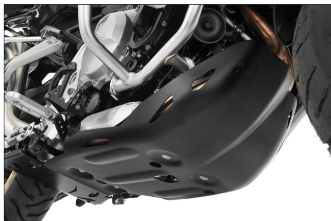
... and black anodised (Item-No.: 26840-302)