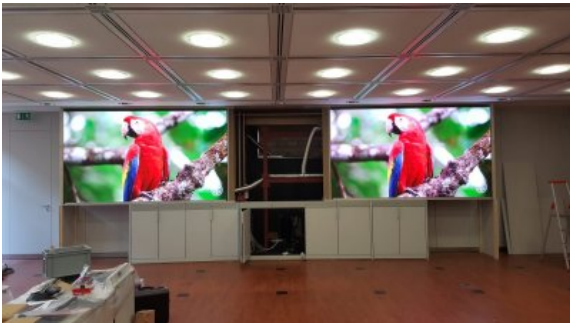
Delta LED modules deliver bright brilliance

Since it was founded in 1966, Hannover Rück has become the fourth largest reinsurer in the world. With around 3,300 employees and 140 subsidiaries, branches and representative offices, the company is represented worldwide. Its strong market position requires leading-edge and optimally equipped conference and meeting rooms. While on one hand the rooms must offer the highest levels of current technical level excellence, on the other hand, they must also be flexible so that they can easily accommodate future developments.