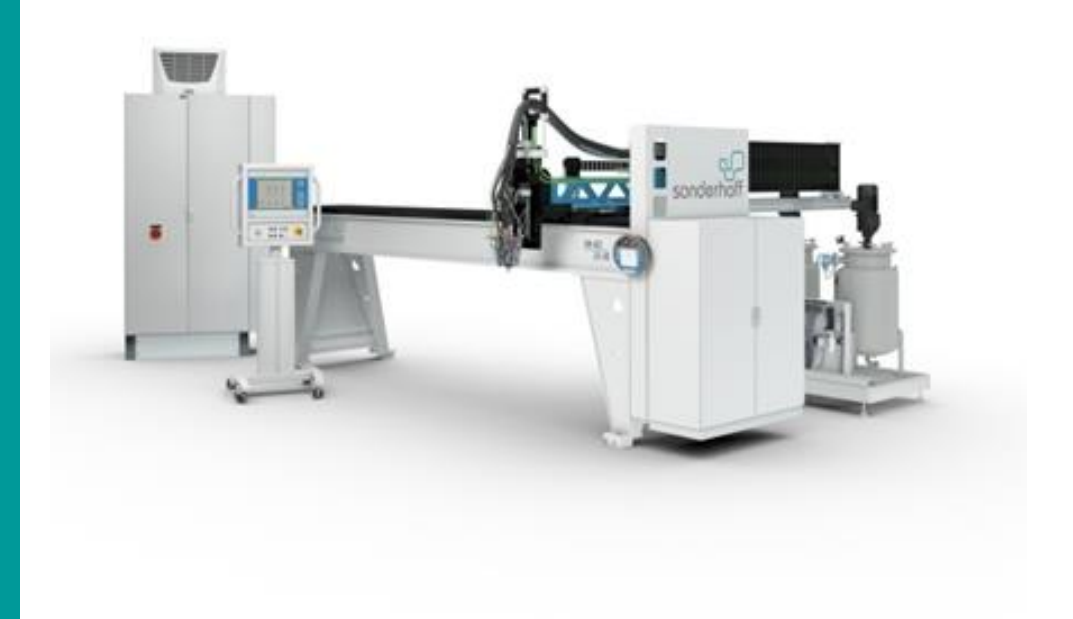
New Mixing and Dosing System DM 402/403 for foam sealing, gluing and potting