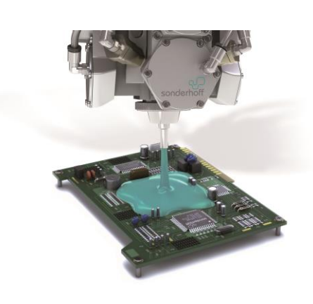
2-Component Formed In-Place Casting with polyurethane potting systems FERMADUR®