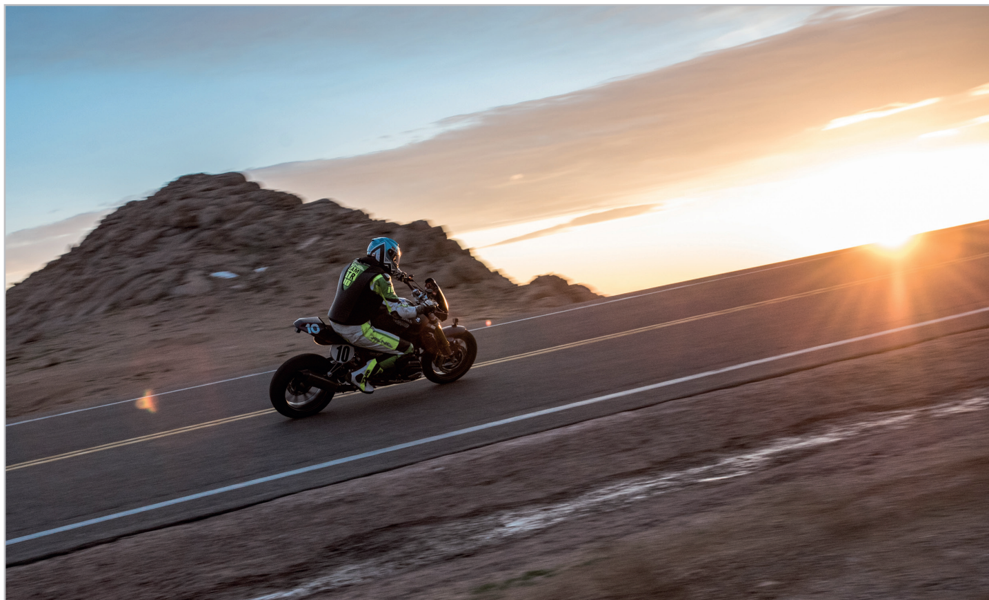
Thilo Günther on Wunderlich R 1200 R »RennR« at Pikes Peak 2017