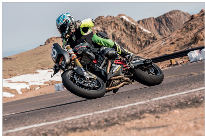
Thilo Günther on Wunderlich R 1200 R »RennR« 2017