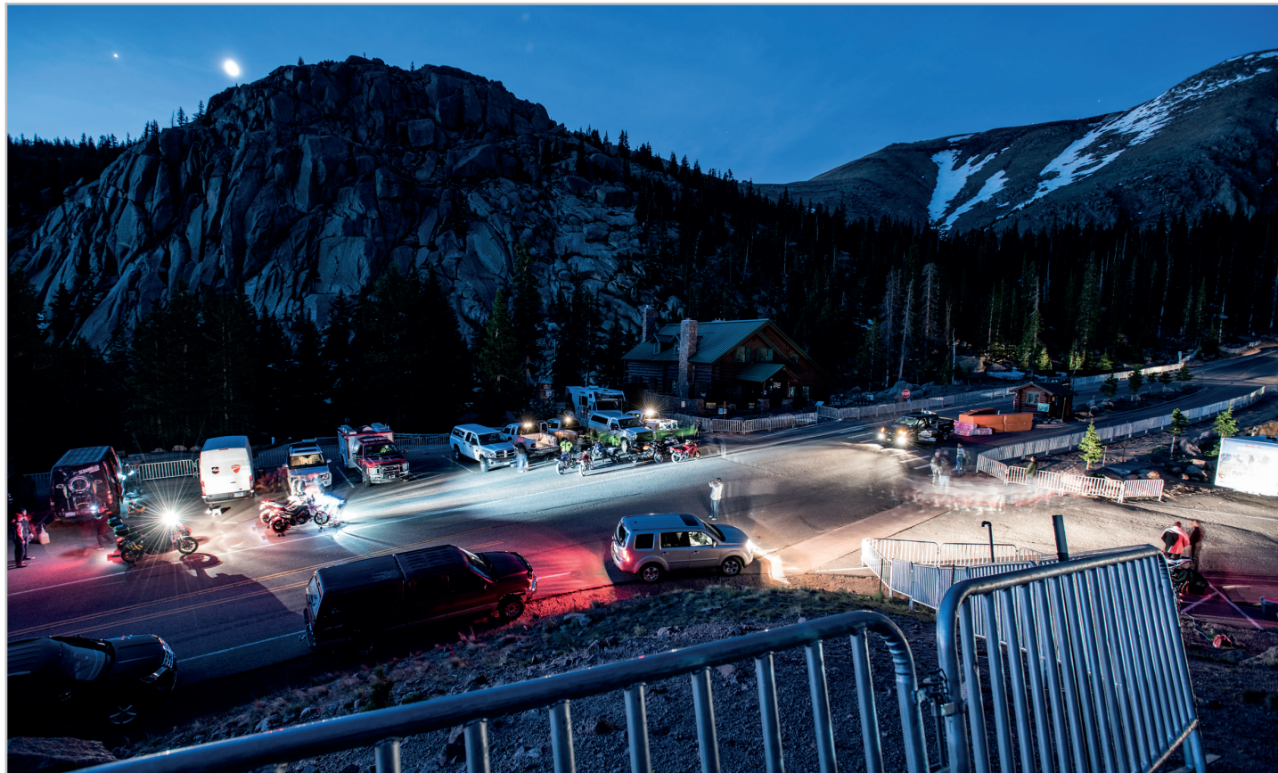
View in paddock during Pikes Peak International Hill Climb 2017