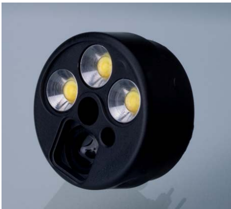
Picture System component for endoscopy

The range of Health Care & Life Science products which will be on display includes polymer-based modules and systems intended for minimal invasive methods in diagnostics and therapy in order to facilitate procedures that reduce the level of stress to patients and are more cost-efficient at the same time. Polymer-based single and system components are successfully employed in endoscopy. They include, among other options, illumination optics and lighting modules, as well as camera modules, combined modules and disposables. The expertise and skills which are required to create such products in terms of LED technology, optics, IC packaging and assembly are fully integrated in our established manufacturing process.