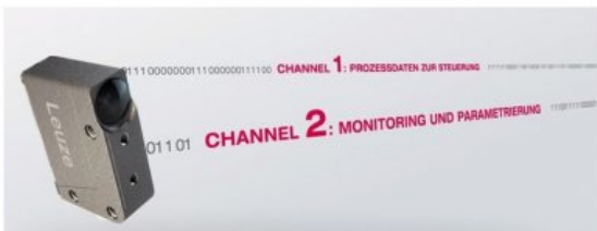
Fig. 1: The dual-channel principle

Leuze electronic optimally supports this different communication characteristic by means of the dual channel principle. While the data for process control is transferred in real time over the first sensor channel, the second sensor channel transmits the information for monitoring and analyzing the machine. The principle is the same for all sensors with an interface(s), regardless of the sensor's complexity.