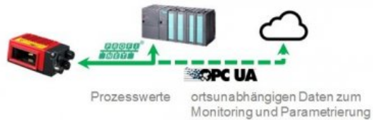
Fig. 4: Dual channel and IIoT / Industry 4.0 with fieldbus interface sensor

the OPC-UA communication protocol. It can be transported all the way to a cloud application via an integrated cloud connector or an IoT Edge Gateway.