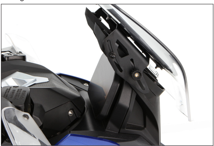
... and lockable in any desired position