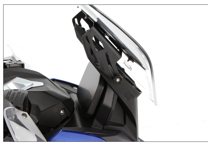
Can be shifted upwards by 60 mm from the standard basic setting ...

*Prices may vary from country to country