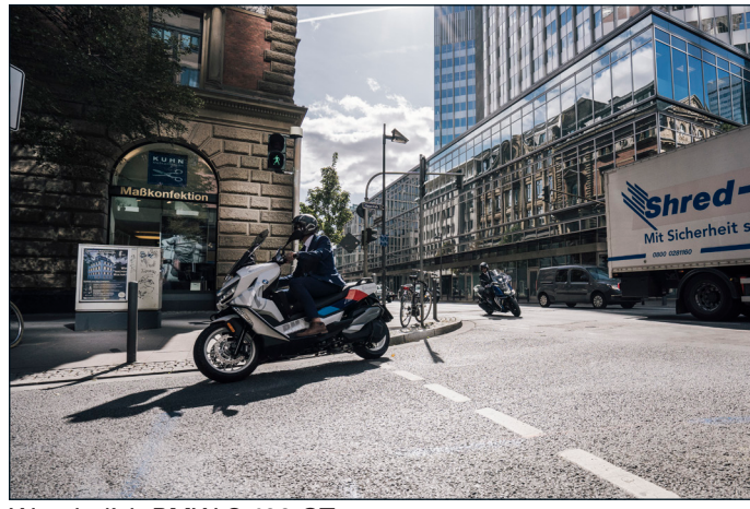
Wunderlich BMW C 400 GT