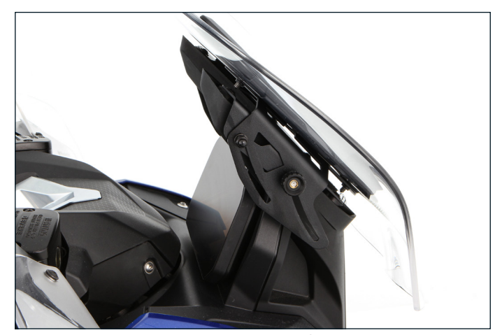
Ergonomically located knurled wheel for easy adjustment, even on the go