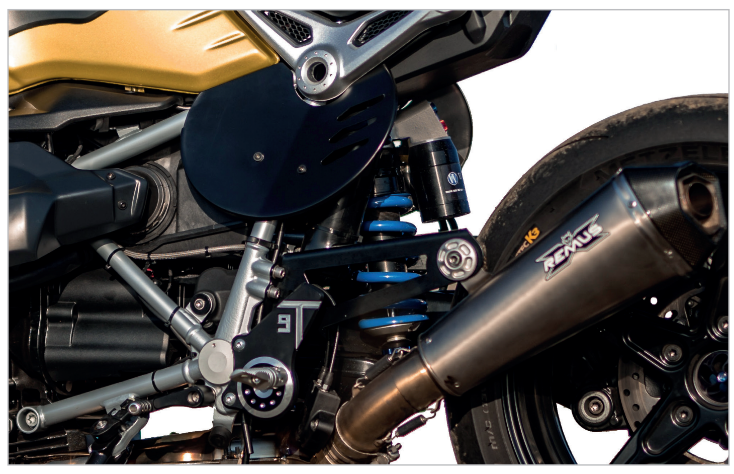
Wunderlich suspension strut for excellent driving behavior and footrest system 9T-Vario