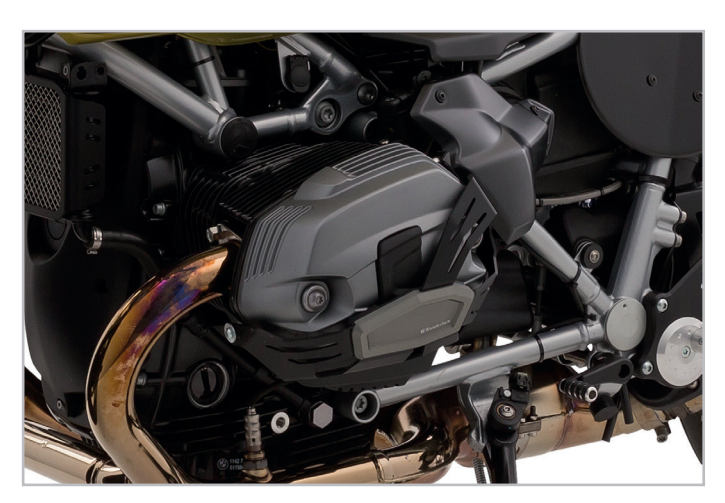
Wunderlich valve cover