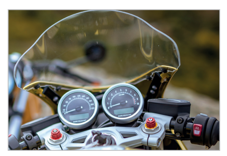
Wunderlich windscreen "TT