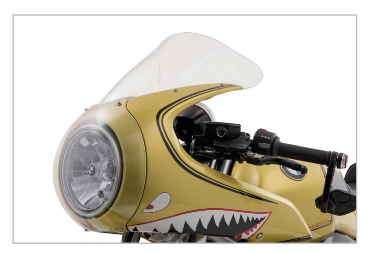
Wunderlich headlight cover "TT"