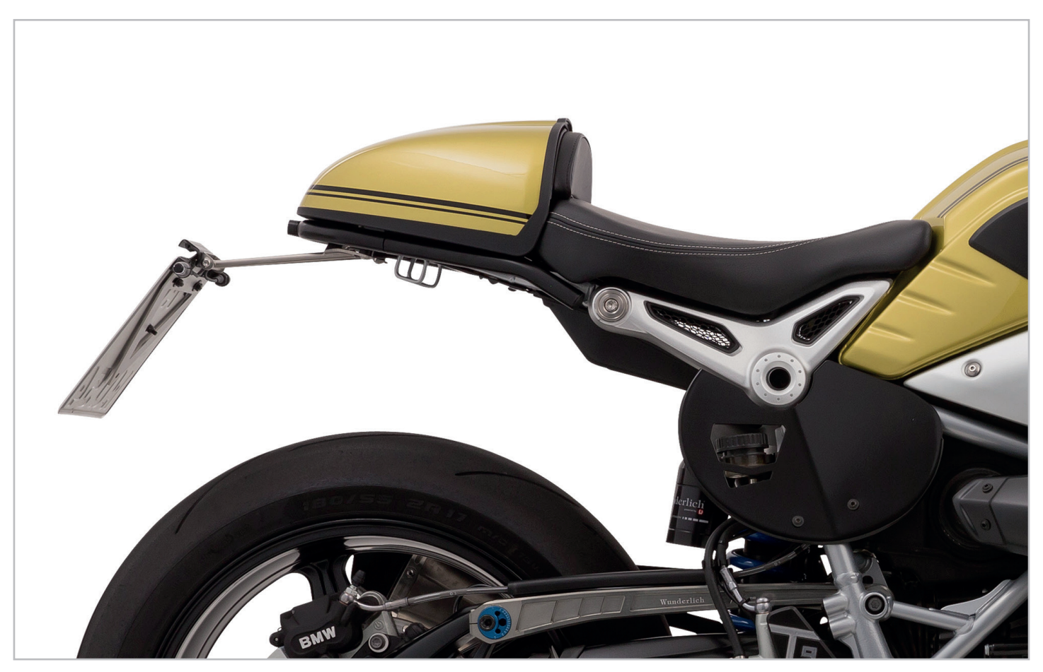
Wunderlich rear conversion "Sport"