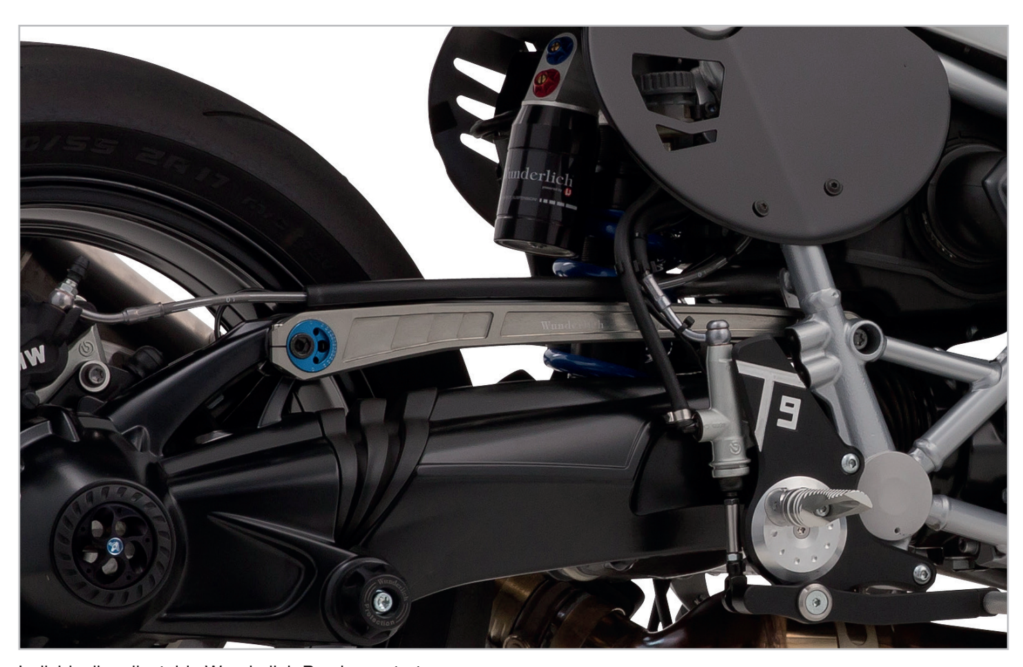
Individually adjustable Wunderlich Paralever strut