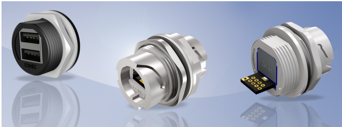
Caption: IP67 RJ45 Cat 6A & IP67 USB 2.0 Dual Port

Title: CONEC Connector series IP67 RJ45 + IP67 USB 2.0 Dualport – Real-time data transmission and optimal protection in harsh environments..