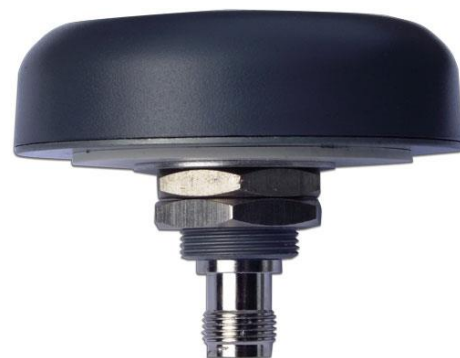
TW3972 Dimensions (mm)

This product is also available in an OEM format (TW3967 for 28dB and TW3972E for 35dB)