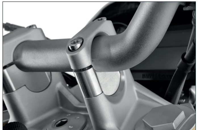
Wunderlich handlebar riser +25 mm for models with and without sat nav - Item No.: 31000-111 | -211