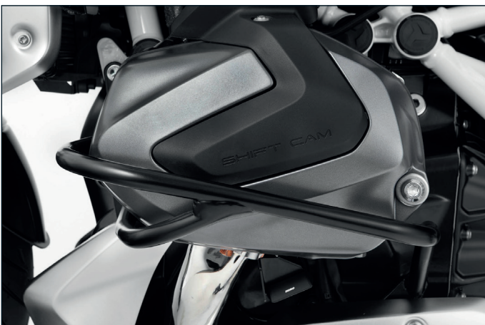
Wunderlich »SPORT« engine protection bar is available in black and white - Item No.: 31740-30x