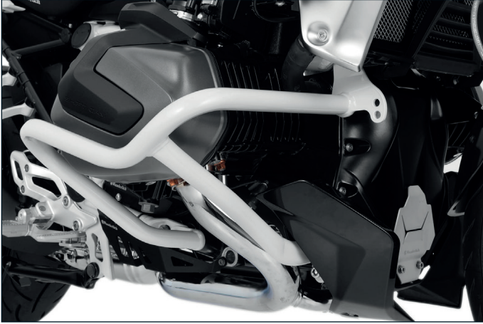
Wunderlich engine protection bar R 1250 R in white... Item No.: 26442-004