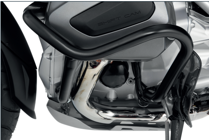
...in black... Item No.: 26442-002