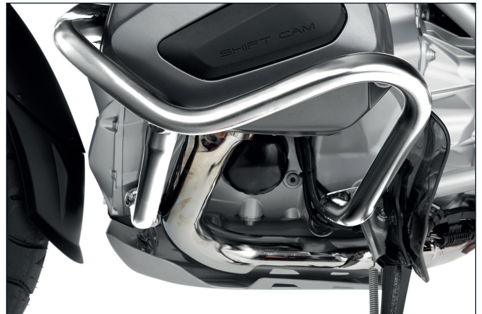
...and in stainless steel, glass bead blasted and electro polished... Item No.: 26442-000