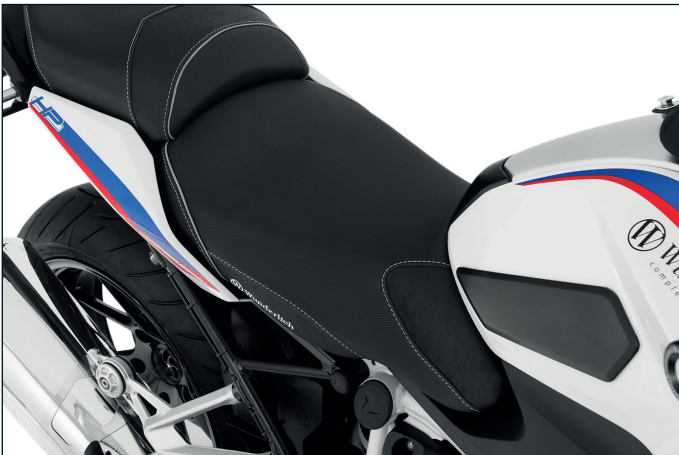
Wunderlich »AKTIVKOMFORT« rider seat standard height or +30 mm - Item No.: 30900-11x