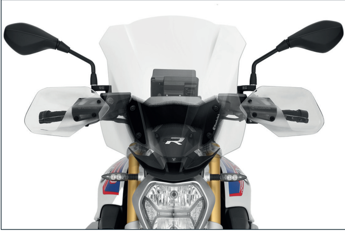
Wunderlich »R-MARATHON« clear windshield...