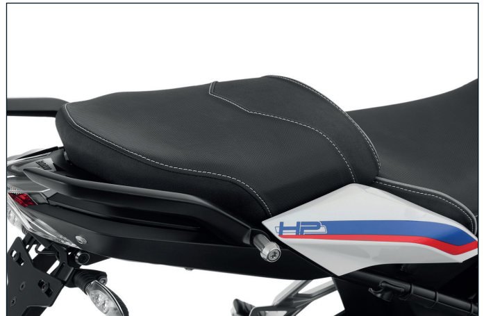
Wunderlich »AKTIVKOMFORT« passenger seat Item No.: 30900-220