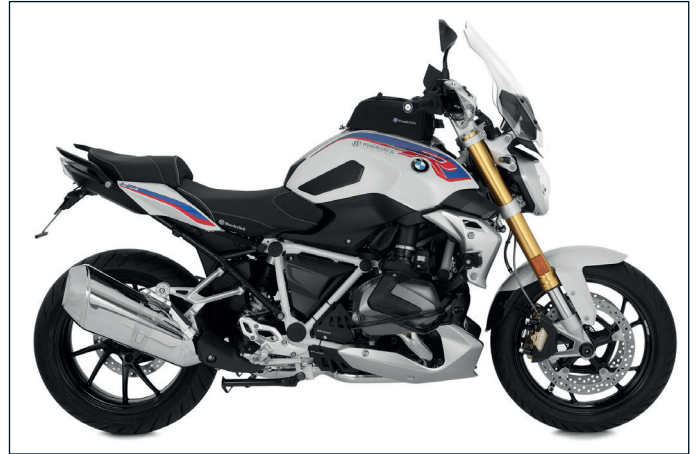
Roadster action: BMW R 1250 R with Wunderlich-components

The handlebar risers from Wunderlich are known for their