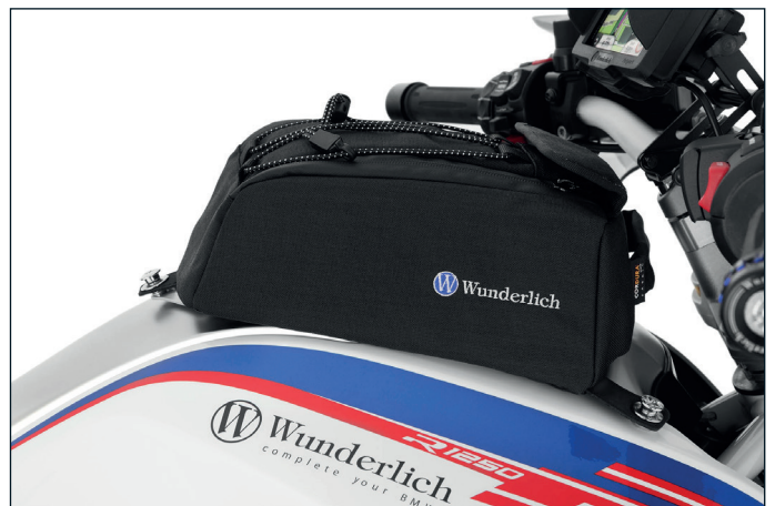
Wunderlich »ELEPHANT SPORT« tank bag - Item No.: 20653-400