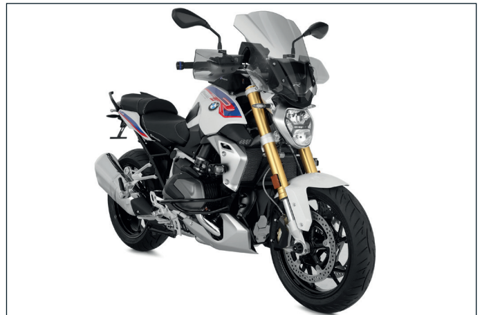
BMW R 1250 R with Wunderlich-components