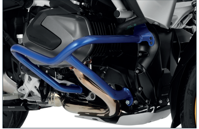
...in blue... Item No.: 26442-005