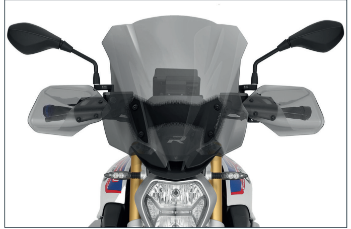
...or smoked grey - Item No.: 30450-23x