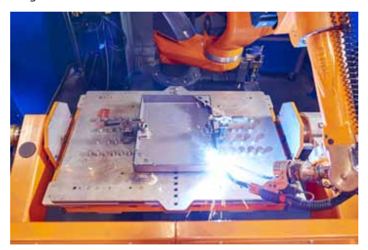
Photo 5: The large range of the seven-axis robot facilitates and accelerates the welding of the complex workpieces

component types. "We were able to significantly reduce the secondary process times in this manner," Kühne states. "Since implementing the compact system for welding the manhole systems, we have increased our output by an average of 20%."